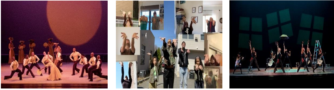
Left to right: Alvin Ailey American Dance Theater in Alvin Ailey's Revelations. Ailey dancers performing 'I Been 'Buked' from Alvin Ailey's Revelations. Alvin Ailey American Dance Theater in Alvin Ailey's Blues Suite from Timeless Ailey 60th Anniversary program.

Ctrl + Click for hi-res download. Please credit photos.