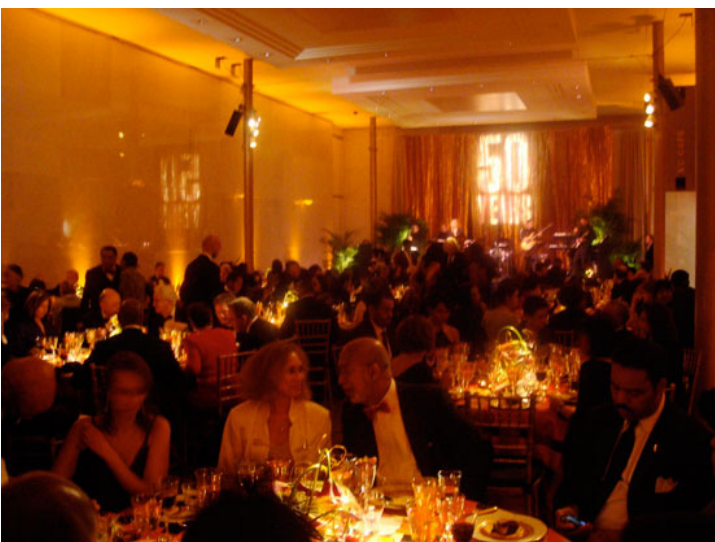
Dinner in full swing.