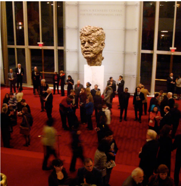
The Opera House lobby during the first intermission.

There was disappointment but not surprise among veterans of Washington's hectic pace, especially in the first 100 days of a new Administration, not to forget the high wire act of getting a stimulus bill through Congress, and unexpected Cabinet vacancies. The workload is intense, and the hours seemingly too few, to be able to pack it all in. "This is about just getting adjusted, and thinking they can accept a night out, and then finding work intercedes," said the source. The push pull of work and social life are particularly up against each other on weeknights when Congress is in session.