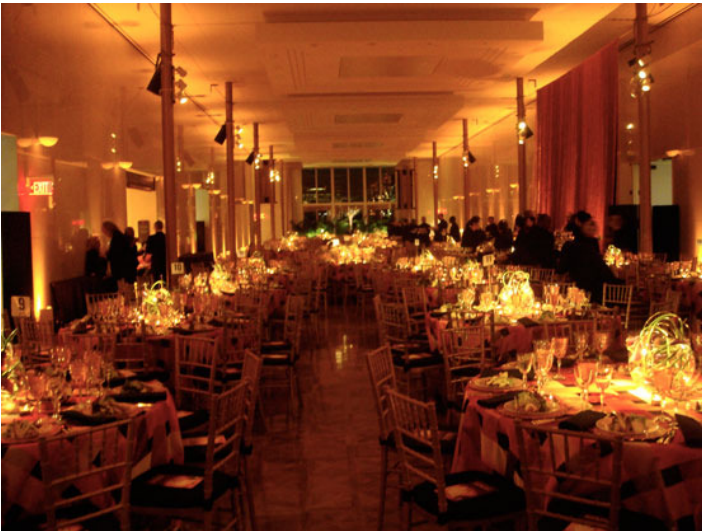
The Kennedy Center's Roof Terrace before the Alvin Ailey 50th Anniversary gala dinner dance.