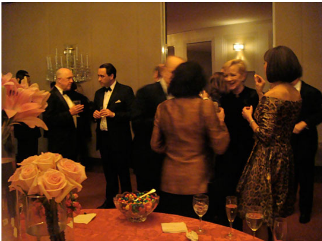
Inside the “member only” Circle lounge, where they have plenty of champagne and M&M’s.