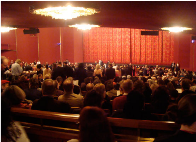
SRO at the Alvin Ailey 50th anniversary in the Kennedy Center Opera House.