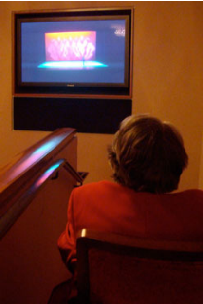
An usher watches the performance on a TV monitor