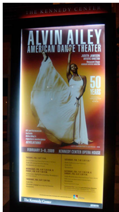
Announcing a week of shows at the Kennedy Center marking the 50th anniversary of the Alvin Ailey Dance Theater.