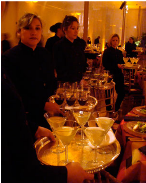
At the dinner: ready for the guests to arrive