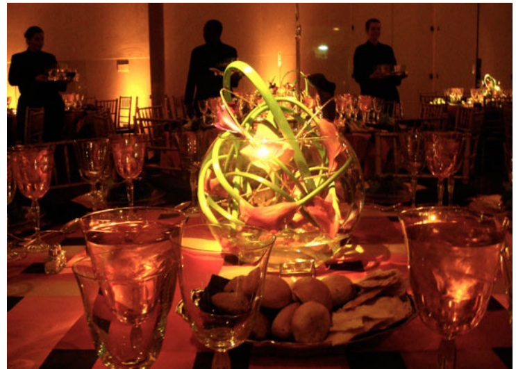
The table setting at the Alvin Ailey dinner.