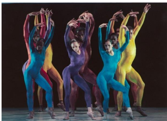
Alvin Ailey American Dance Theater in Polish Pieces . Photo by Paul Kolnik.

In Polish Pieces , Dutch choreographer van Manen displays his mastery for building dazzling creations from simple motifs and geometric patterns. Driven by the rhythms of Henryk Górecki's score, the 12 dancers in this colorful ensemble work create a brilliant kaleidoscope of energy in pulsating group sections. The endlessly shifting formations contrast with two sensual and lyrical pas de deux.