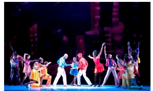
AAADT in Talley Beatty's Stack-Up.

Set to the background of a throbbing 1970s beat (including music by Earth, Wind & Fire, Grover Washington, Jr., Fearless Four, and Alphonze Mouzon) and a graffiti landscape, patrons in a crowded disco dance with attitude, sass, and fierce despair in this classic work by Talley Beatty. Inspired by Los Angeles' urban landscape and the lives of its disparate inhabitants, Stack-Up depicts the emotional "traffic" in a community that is stacked on top of each other. Tough, brutal yet poignant, the stage sizzles with street life, break dancing, and physical pyrotechnics as an aloof drug pusher and two displaced lovers are destined for collision. Alvin Ailey American Dance Theater performed the work during its 25 th anniversary season in 1983 at New York City Center, and is being restaged in advance of the upcoming centennial of Mr. Beatty's birth.